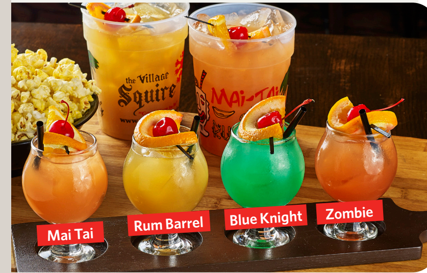
Mai Tai Rum Barrel Blue Knight Zombie