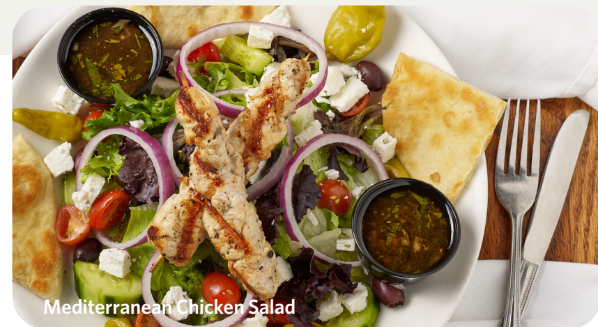
Mediterranean Chicken Salad

CRISPY CHICKEN CAESAR WRAP Crispy chicken fingers wrapped with Parmesan, romaine, diced tomatoes and Caesar dressing in a whole wheat tortilla. 12.99